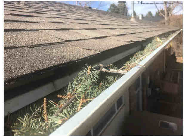
Winter winds can add a surprising amount of debris to the gutters.