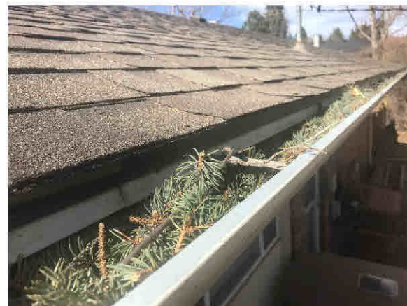
Winter winds can add a surprising amount of debris to the gutters.

"When spring came, even the false spring, there were no problems except where to be happiest." - Ernest Hemingway